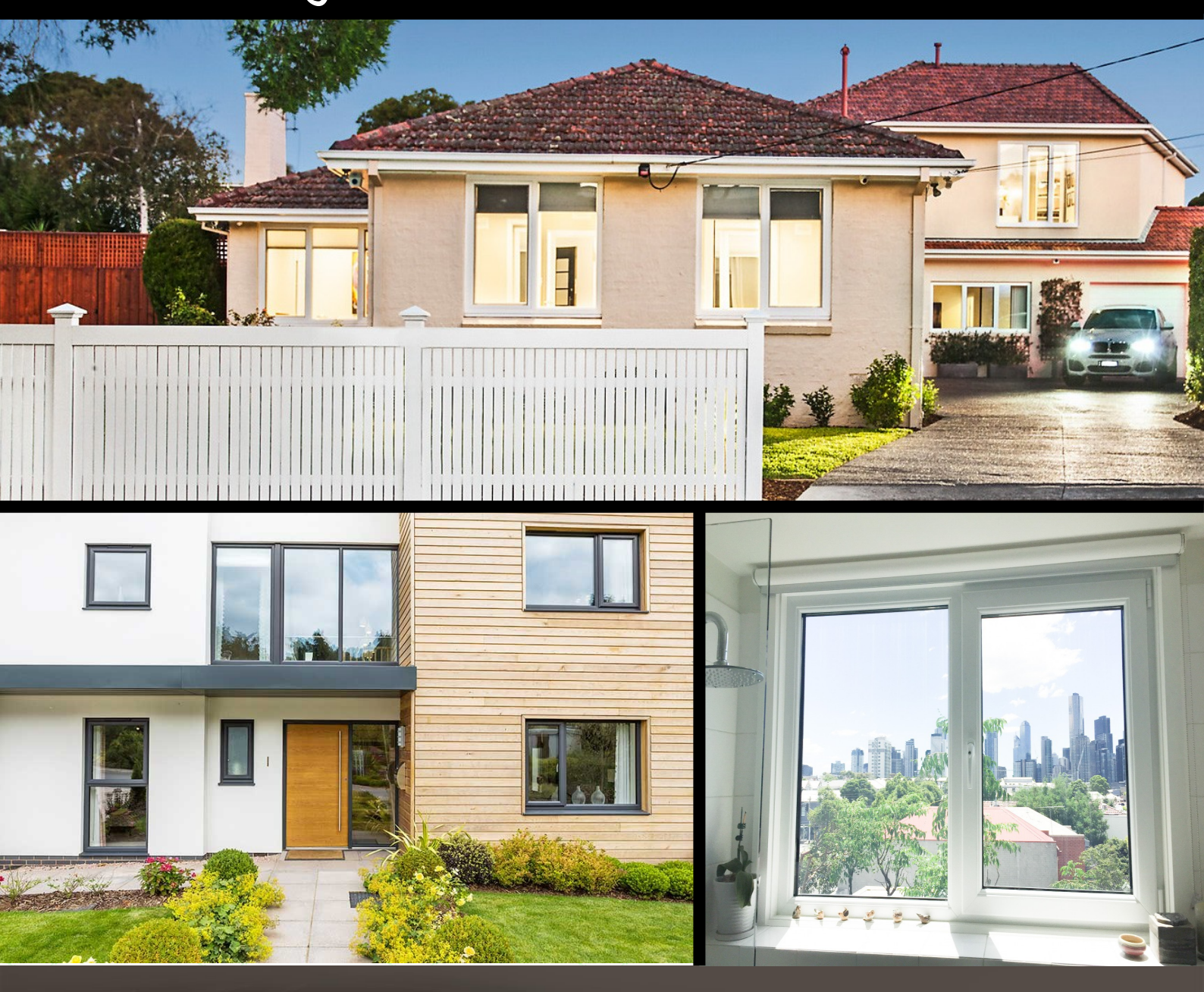
"NU-ECO Windows will increase the Value of your Home"