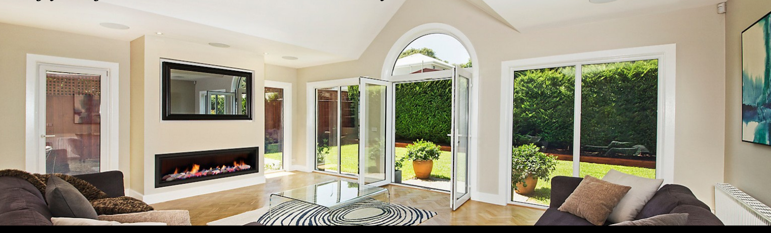
Elegant, durable and secure.

"NU-ECO Energy Rated windows will have a positive effect on both the lowering of your fuel bills and noise levels within your home".